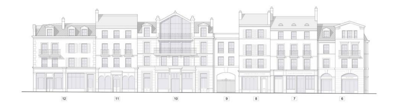
Street Elevation (East)